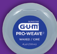
GUM® Pro-Weave® Floss, Waxed 1115 (1 box - 144ea/box)