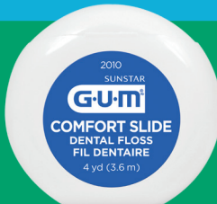
2010 Comfort Slide®