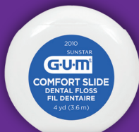
GUM® Comfort Slide Floss 2010* (1 box - 144ea/box)