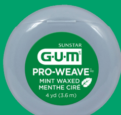
1815 Pro-Weave® Mint Waxed

Buy 3 boxes of any GUM® patient size floss (4yd), get one box of any GUM® floss free! A $50+ value!