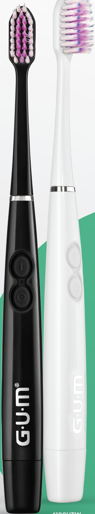
4100UTB (refill # 4110URB)