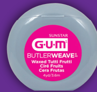
GUM® ButlerWeave® Floss, Waxed, Tutti-Frutti 1415 (1 box - 144ea/box)