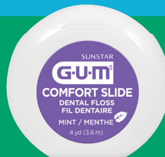
2014 Comfort Slide® Mint