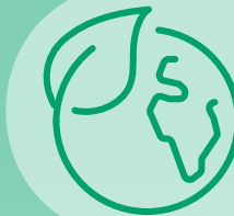
828PR Twisted Mint™