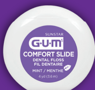
GUM® Comfort Slide Floss, Mint 2014* (1 box - 144ea/box)