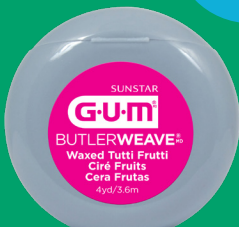
1415 ButlerWeave® Tutti-Frutti