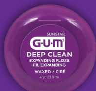
GUM® Deep Clean Expanding® Floss 2030 (1 box - 144ea/box)