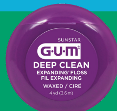
2030 Deep Clean Expanding® Floss