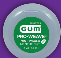
GUM® Pro-Weave® Floss, Mint Waxed 1815 (1 box - 144ea/box)