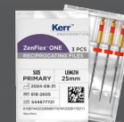
ZenFlex™ ONE Reciprocating File System