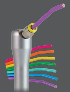
Seal-Tight™ Disposable Air/Water Syringe Tips

To view a list of all products that qualify for double reward points visit loyalty.kerrdental.com