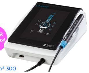
Cavitron® 300 #8161429