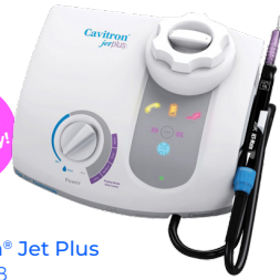
Cavitron® Jet Plus #8161428