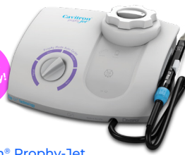
Cavitron® Prophy-Jet #8161427